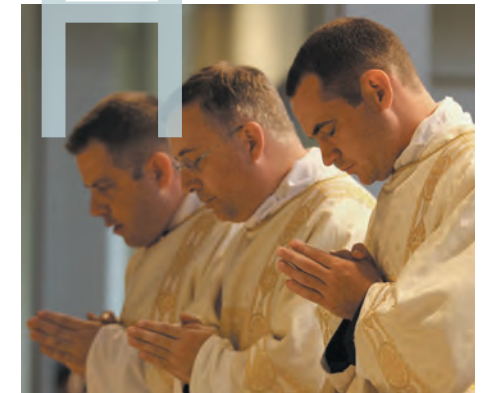
2011-15 Number of endowments grew to 230. Assets held grew to $33,156,202.