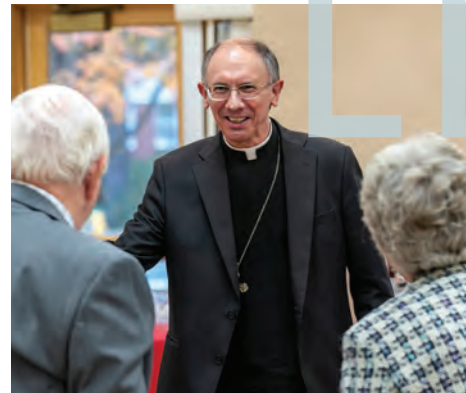
2000-05 Number of endowments grew to 124. Assets held grew to $12,449,675.