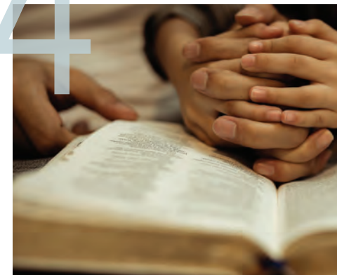
2024 30th Anniversary. Dispersed more than $17.5 million from endowments. 1,700 CHS members.