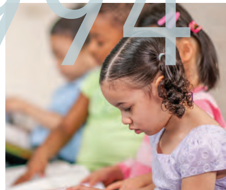
2016-20 Number of endowments grew to 278. Assets held grew to $58,139,589.