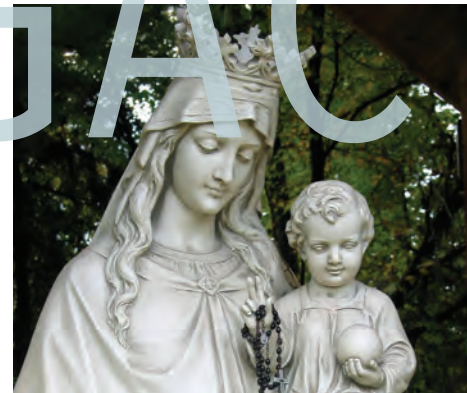
2004 10th Anniversary. Dispersed more than $1,301,405 from endowments. 550 CHS members.