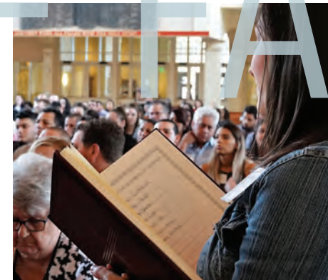
2006-10 Number of endowments grew to 182. Assets held grew to $16,887,446.