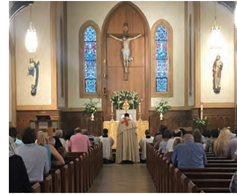
2001 Established grant award process using four of the Foundation's endowment funds. From 2001-24 has awarded 426 grants totaling $1,212,000.