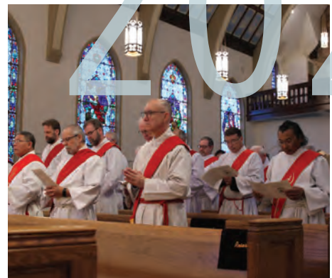
2021-24 Number of endowments grew to 367. Assets held grew to $97,152,042.