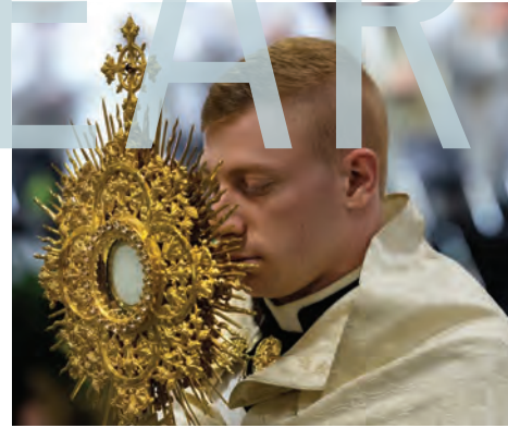
1994-99 Number of endowments grew from 17 to 50. Assets held grew from $105,450 to $6,129,850.