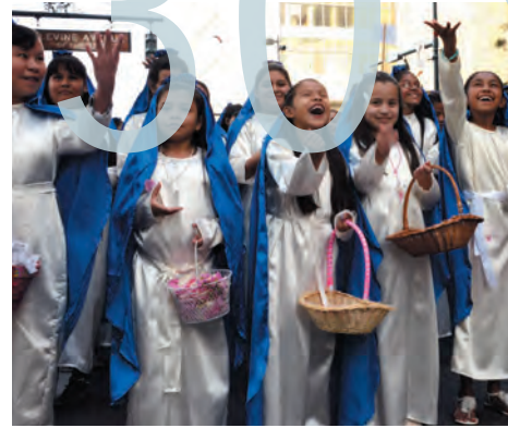
1994 First endowment established to provide funds for programs that support the poor, minority communities and evangelical initiatives.