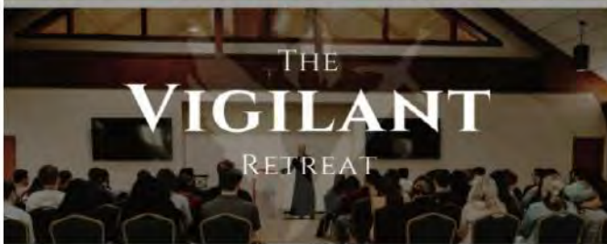
THE VIGILANT RETREAT