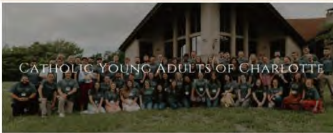
CATHOLIC YOUNG ADULTS OF CHARLOTTE